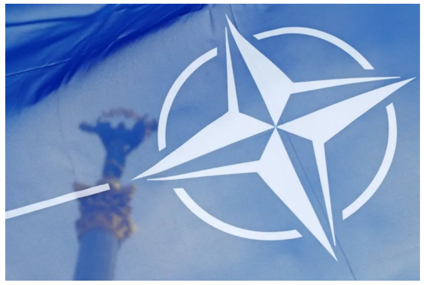
The NATO flag flying in Independence Square in Kyiv, January 2022