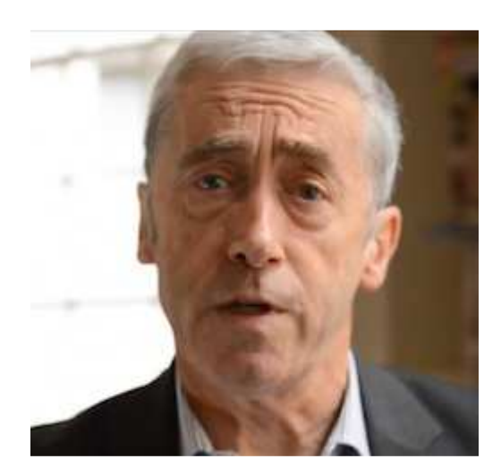
Paul De Grauwe

Slow growth in the Eurozone has become endemic since the start of the sovereign debt crisis in 2010. This is made very clear in Figure 1, which contrasts the growth experience of the Eurozone with the non-Eurozone EU-member countries since the start of the financial crisis in 2007. What is striking is that up to the Eurozone sovereign debt crisis of 2010 the growth experiences of the Eurozone and non-Eurozone countries in the EU were very similar. Both groups of countries saw their boom collapse and turn into a deep recession in 2008-09. Both recovered relatively quickly in 2010. Since 2011, however, the two groups of countries depart. The Eurozone experienced a new recession and since then has experienced a growth rate that on average has been 2% below the growth rate of the EU-countries that are not part of the Eurozone.