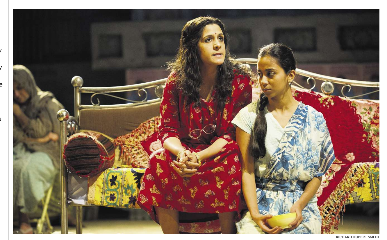
A scene from "Behind the Beautiful Forevers," an adaptation of Katherine Boo's nonfiction book at the National Theater in London.